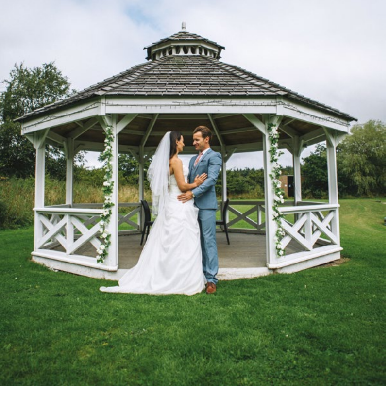
Blissful Wedding Package cost: £4,200

The package will include the following based on 40 guests for the day reception and 80 guests for the evening.